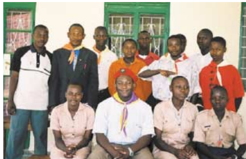
The Xavarian Group at Kyengeza