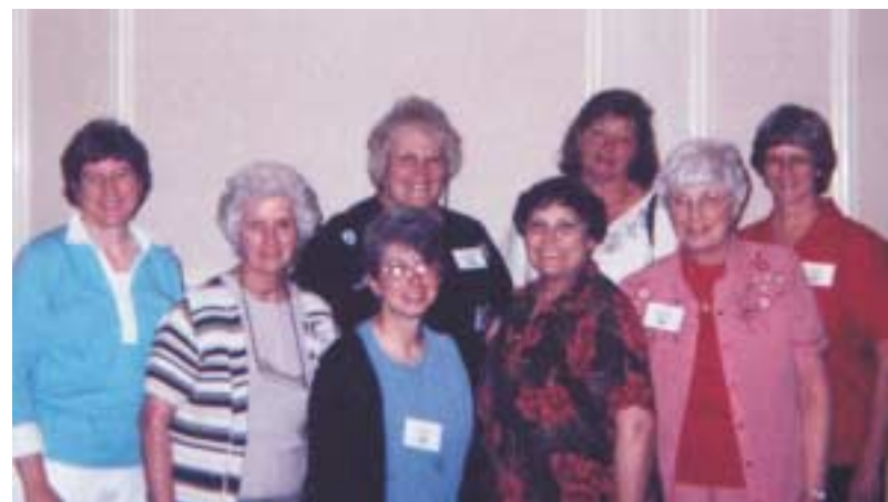
Members of the OCDS Community in Denver, Colorado attending the Congress