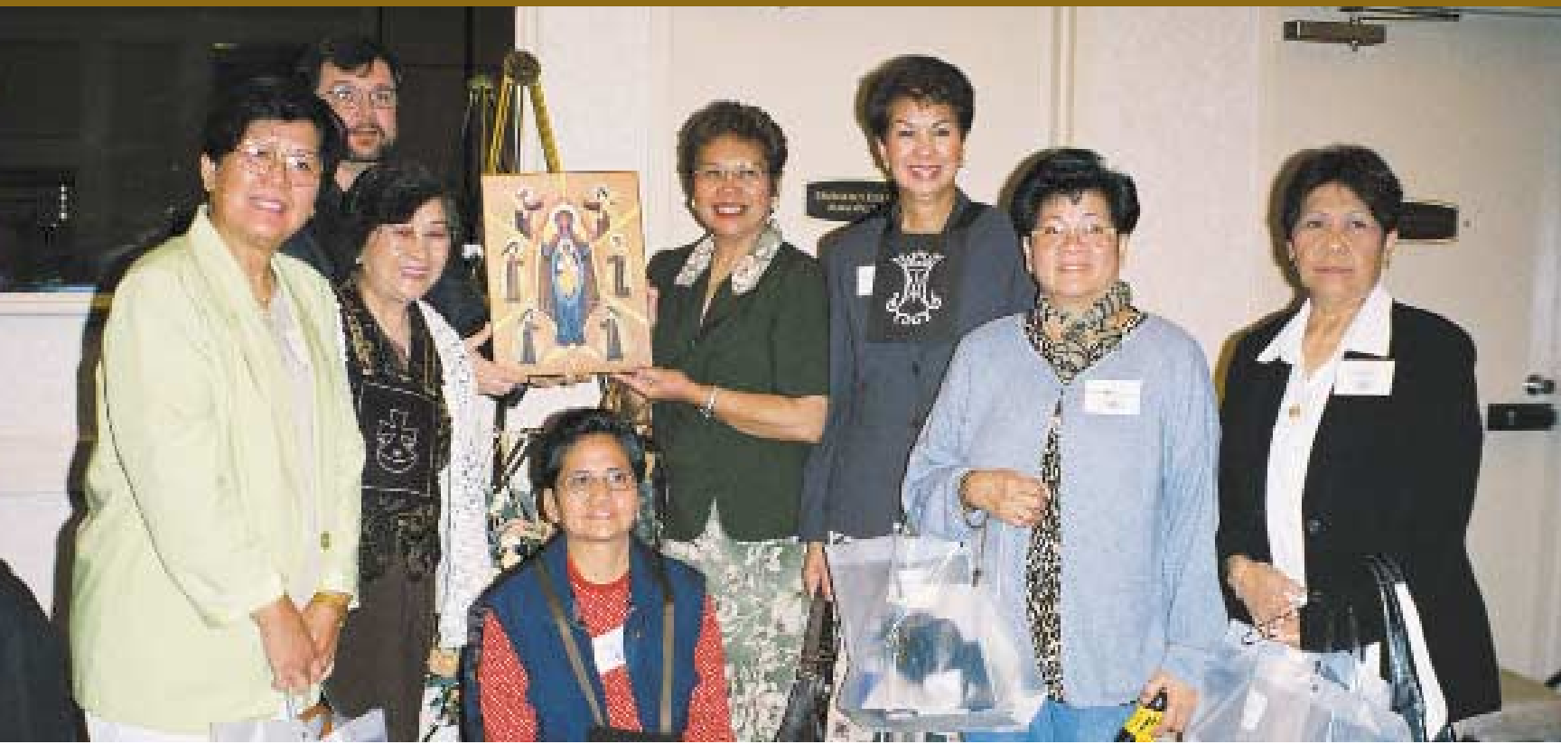
OCDS members gather around an icon